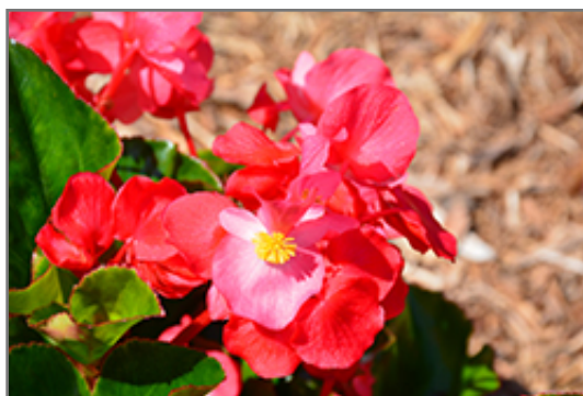
Whopper Rose Green Leaf Begonia flowers