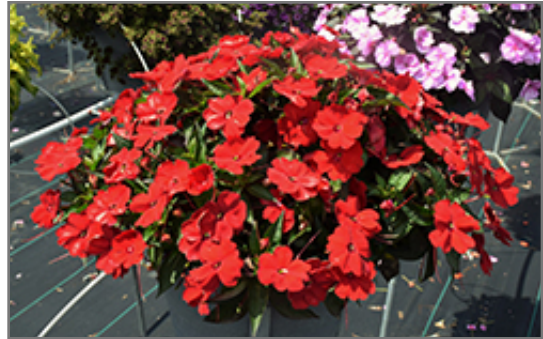
SunPatiens Compact Red New Guinea Impatiens in bloom

SunPatiens Compact Red New Guinea Impatiens will grow to be about 24 inches tall at maturity, with a spread of 24 inches. When grown in masses or used as a bedding plant, individual plants should be spaced approximately 20 inches apart. Its foliage tends to remain dense right to the ground, not requiring facer plants in front. This fast-growing annual will normally live for one full growing season, needing replacement the following year.