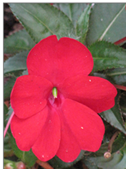
SunPatiens Compact Red New Guinea Impatiens flowers

SunPatiens Compact Red New Guinea Impatiens is recommended for the following landscape applications;