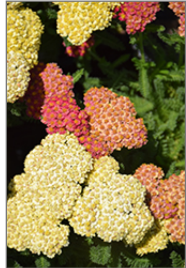
Desert Eve Terracotta Yarrow flowers

Desert Eve Terracotta Yarrow is recommended for the following landscape applications;