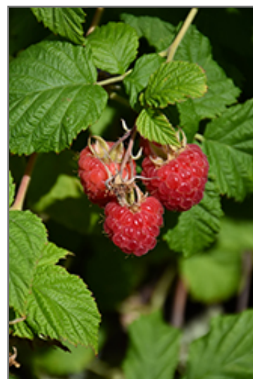
Raspberry Shortcake Raspberry fruit

This is an open multi-stemmed deciduous shrub with an upright spreading habit of growth. Its relatively coarse texture can be used to stand it apart from other landscape plants with finer foliage. This is a high maintenance plant that will require regular care and upkeep. Each spring, cut back all dead and two-year old canes to the ground, leaving only last year's growth standing. It is a good choice for attracting birds to your yard. Gardeners should be aware of the following characteristic(s) that may warrant special consideration;