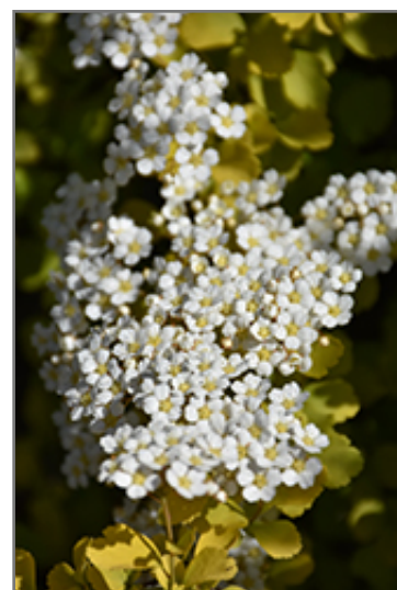
Glow Girl Birch Leaf Spirea flowers