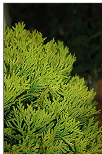
Anna's Magic Ball Arborvitae foliage