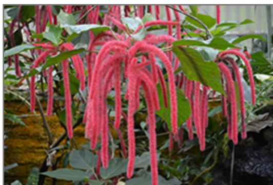
Firetail Chenille Plant flowers