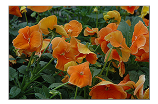
Delta Pure Deep Orange Pansy flowers