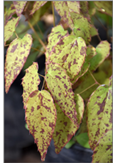
Pink Champagne Fairy Wings foliage

Pink Champagne Fairy Wings will grow to be about 12 inches tall at maturity extending to 16 inches tall with the flowers, with a spread of 24 inches. When grown in masses or used as a bedding plant, individual plants should be spaced approximately 18 inches apart. Its foliage tends to remain dense right to the ground, not requiring facer plants in front. It grows at a medium rate, and under ideal conditions can be expected to live for approximately 10 years. As an herbaceous perennial, this plant will usually die back to the crown each winter, and will regrow from the base each spring. Be careful not to disturb the crown in late winter when it may not be readily seen!