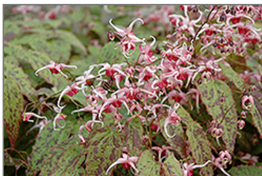
Pink Champagne Fairy Wings flowers

Pink Champagne Fairy Wings is recommended for the following landscape applications;