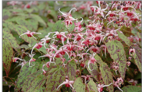
Pink Champagne Fairy Wings flowers

Pink Champagne Fairy Wings is recommended for the following landscape applications;