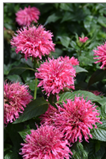
Bubblegum Blast Beebalm flowers

Bubblegum Blast Beebalm is recommended for the following landscape applications;