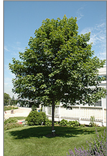
Fall Fiesta Sugar Maple

This tree should only be grown in full sunlight. It prefers to grow in average to moist conditions, and shouldn't be allowed to dry out. It is not particular as to soil pH, but grows best in rich soils. It is somewhat tolerant of urban pollution. This is a selection of a native North American species.