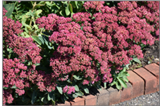
Carl Stonecrop in bloom

Carl Stonecrop is recommended for the following landscape applications;