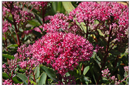
Carl Stonecrop flowers