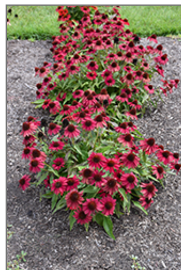
Sombrero Baja Burgundy Coneflower in bloom