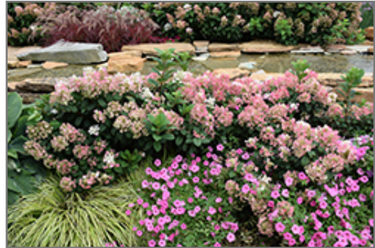
Little Quick Fire Hydrangea in bloom

This shrub performs well in both full sun and full shade. It prefers to grow in average to moist conditions, and shouldn't be allowed to dry out. It is not particular as to soil type or pH. It is highly tolerant of urban pollution and will even thrive in inner city environments. Consider applying a thick mulch around the root zone in winter to protect it in exposed locations or colder microclimates. This is a selected variety of a species not originally from North America.