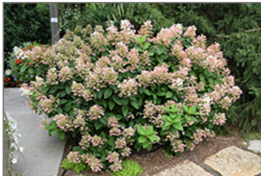
Little Quick Fire Hydrangea in bloom