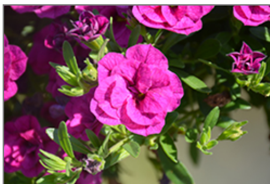
MiniFamous Double Purple Calibrachoa flowers