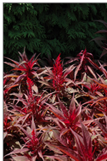
Dragon's Breath Plumed Celosia flowers