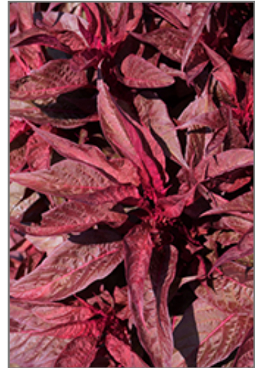
Dragon's Breath Plumed Celosia foliage

Dragon's Breath Plumed Celosia is a fine choice for the garden, but it is also a good selection for planting in outdoor containers and hanging baskets. With its upright habit of growth, it is best suited for use as a 'thriller' in the 'spiller-thriller-filler' container combination; plant it near the center of the pot, surrounded by smaller plants and those that spill over the edges. Note that when growing plants in outdoor containers and baskets, they may require more frequent waterings than they would in the yard or garden.