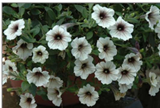
Supertunia Latte Petunia flowers