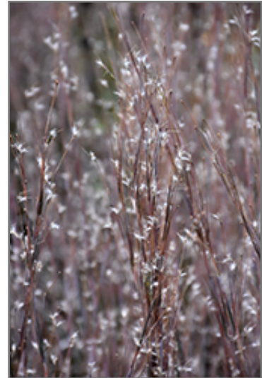
Standing Ovation Bluestem fruit

This plant should only be grown in full sunlight. It is very adaptable to both dry and moist locations, and should do just fine under typical garden conditions. It is considered to be drought-tolerant, and thus makes an ideal choice for a low-water garden or xeriscape application. It is not particular as to soil type or pH. It is somewhat tolerant of urban pollution. This is a selection of a native North American species. It can be propagated by division; however, as a cultivated variety, be aware that it may be subject to certain restrictions or prohibitions on propagation.