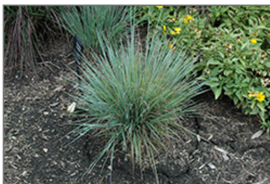
Standing Ovation Bluestem