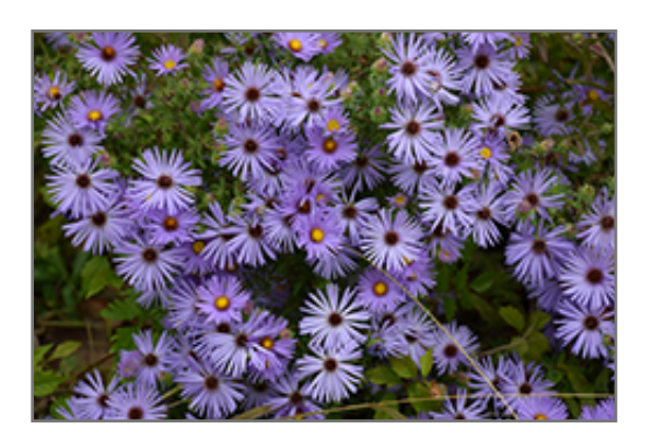
October Skies Aster flowers

October Skies Aster will grow to be about 24 inches tall at maturity, with a spread of 24 inches. Its foliage tends to remain dense right to the ground, not requiring facer plants in front. It grows at a medium rate, and under ideal conditions can be expected to live for approximately 10 years. As an herbaceous perennial, this plant will usually die back to the crown each winter, and will regrow from the base each spring. Be careful not to disturb the crown in late winter when it may not be readily seen!