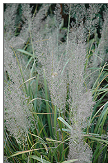
Korean Reed Grass fruit