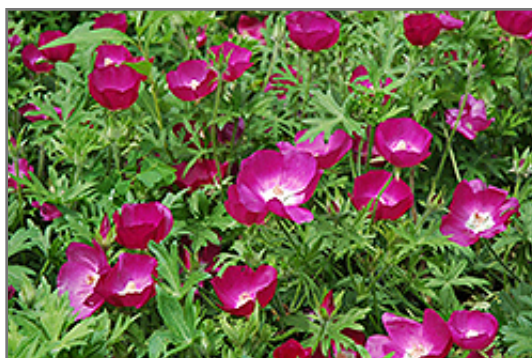
Buffalo Poppy flowers