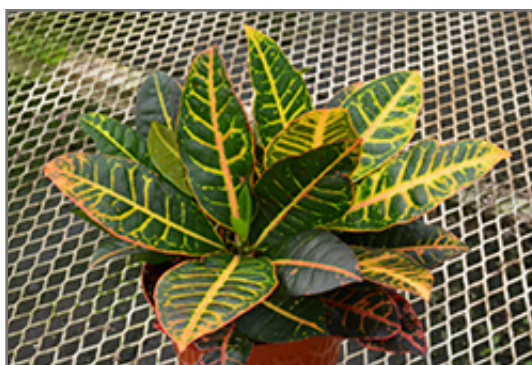
Petra Variegated Croton in full