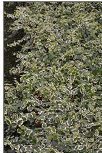
Variegated Creeping Fig in full