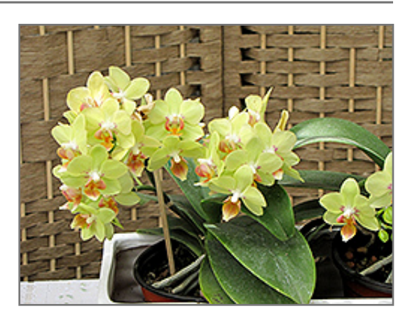
Hybrid Moth Orchid in bloom