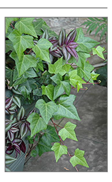
Algerian Ivy foliage

There are many factors that will affect the ultimate height, spread and overall performance of a plant when grown indoors; among them, the size of the pot it's growing in, the amount of light it receives, watering frequency, the pruning regimen and repotting schedule. Use the information described here as a guideline only; individual performance can and will vary. Please contact the store to speak with one of our experts if you are interested in further details concerning recommendations on pot size, watering, pruning, repotting, etc.