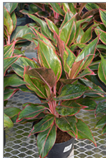
Siam Aurora Chinese Evergreen in full