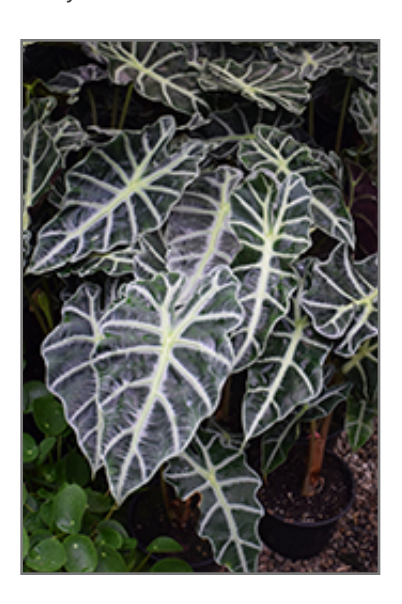
Polly Amazon Elephant's Ear in full