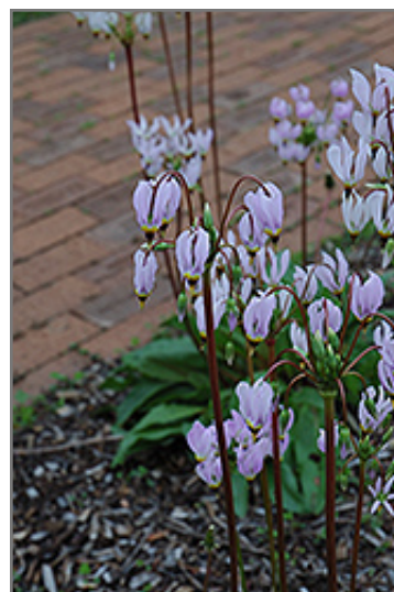
Shooting Star flowers