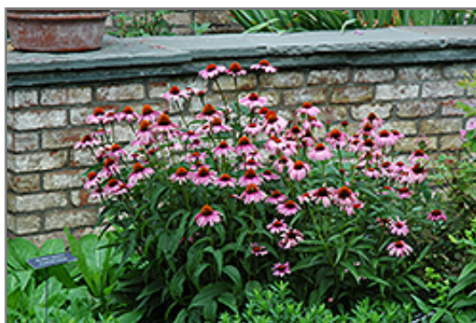
Magnus Coneflower in bloom