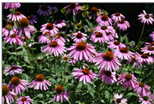
Magnus Coneflower flowers