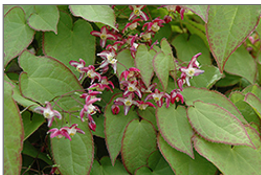
Bishop's Hat flowers