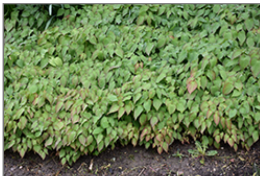
Bishop's Hat