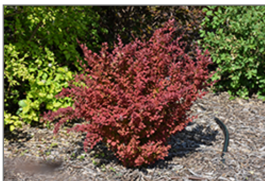
First Editions Toscana Barberry