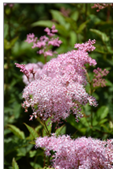
Queen Of The Prairie flowers