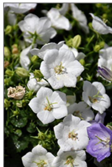
Rapido White Bellflower flowers