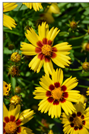
Sunkiss Tickseed flowers