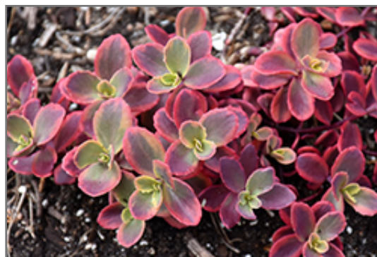
Sunsparkler Wildfire Stonecrop foliage