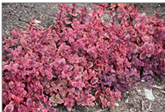
Sunsparkler Wildfire Stonecrop

Sunsparkler Wildfire Stonecrop is a fine choice for the garden, but it is also a good selection for planting in outdoor pots and containers. Because of its spreading habit of growth, it is ideally suited for use as a 'spiller' in the 'spiller-thriller-filler' container combination; plant it near the edges where it can spill gracefully over the pot. Note that when growing plants in outdoor containers and baskets, they may require more frequent waterings than they would in the yard or garden. Be aware that in our climate, most plants cannot be expected to survive the winter if left in containers outdoors, and this plant is no exception. Contact our experts for more information on how to protect it over the winter months.