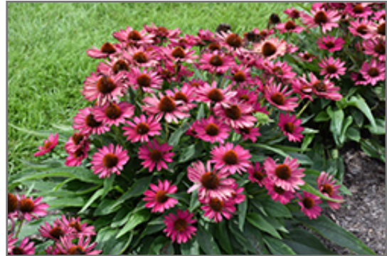
Kismet Raspberry Coneflower in bloom

Kismet Raspberry Coneflower will grow to be about 16 inches tall at maturity, with a spread of 24 inches. Its foliage tends to remain dense right to the ground, not requiring facer plants in front. It grows at a fast rate, and under ideal conditions can be expected to live for approximately 10 years. As an herbaceous perennial, this plant will usually die back to the crown each winter, and will regrow from the base each spring. Be careful not to disturb the crown in late winter when it may not be readily seen!