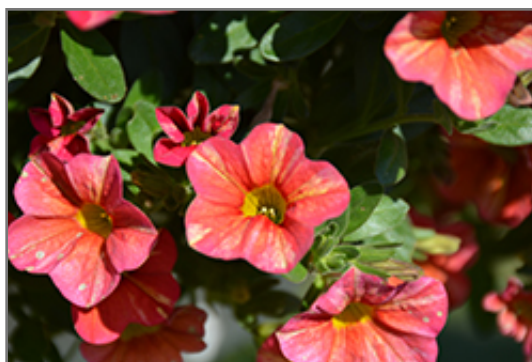
Superbells Tropical Sunrise Calibrachoa flowers

Superbells Tropical Sunrise Calibrachoa is recommended for the following landscape applications;