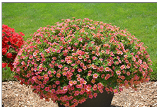
Superbells Tropical Sunrise Calibrachoa in bloom