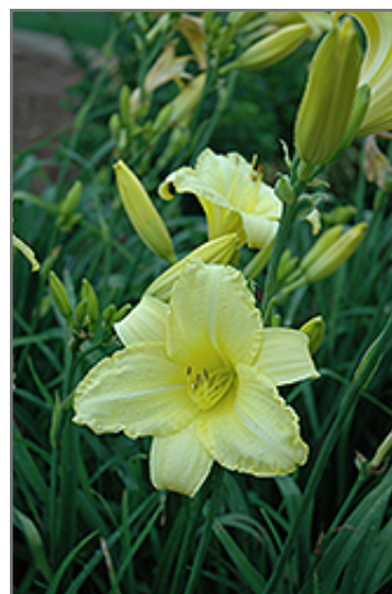
Happy Ever Appster Happy Returns Daylily flowers

Happy Ever Appster Happy Returns Daylily is recommended for the following landscape applications;