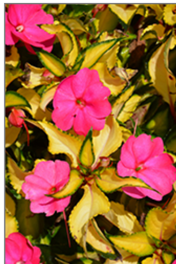
SunPatiens Compact Tropical Rose New Guinea Impatiens flowers

This plant will require occasional maintenance and upkeep, and should not require much pruning, except when necessary, such as to remove dieback. It is a good choice for attracting bees and butterflies to your yard. It has no significant negative characteristics.