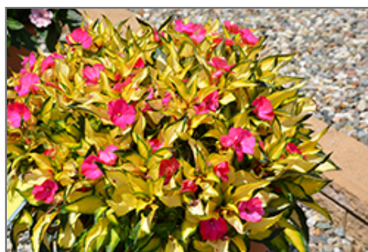
SunPatiens Compact Tropical Rose New Guinea Impatiens in bloom