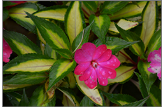
SunPatiens Compact Tropical Rose New Guinea Impatiens flowers

SunPatiens Compact Tropical Rose New Guinea Impatiens is a fine choice for the garden, but it is also a good selection for planting in outdoor containers and hanging baskets. It can be used either as 'filler' or as a 'thriller' in the 'spiller-thriller-filler' container combination, depending on the height and form of the other plants used in the container planting. It is even sizeable enough that it can be grown alone in a suitable container. Note that when growing plants in outdoor containers and baskets, they may require more frequent waterings than they would in the yard or garden.