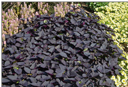
Sweet Caroline Sweetheart Jet Black Sweet Potato Vine

Sweet Caroline Sweetheart Jet Black Sweet Potato Vine is recommended for the following landscape applications;