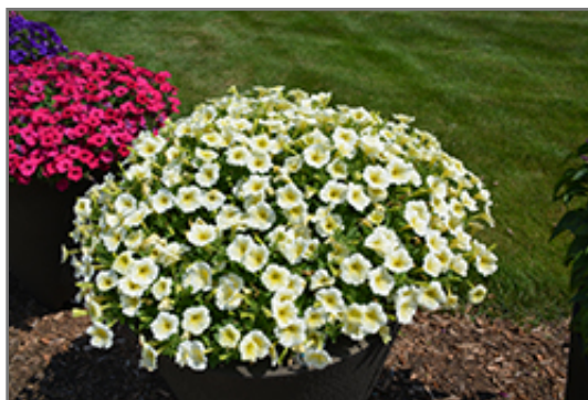
Supertunia Limoncello Petunia in bloom