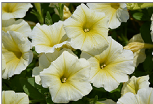
Supertunia Limoncello Petunia flowers

Supertunia Limoncello Petunia is recommended for the following landscape applications;