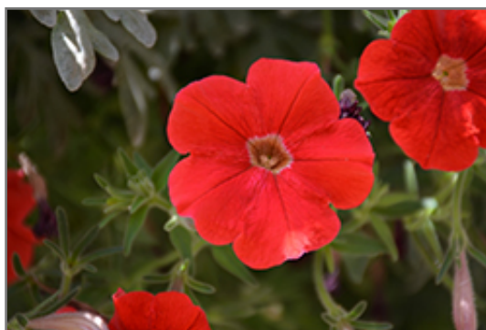
Supertunia Really Red Petunia flowers

Supertunia Really Red Petunia is recommended for the following landscape applications;