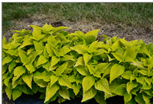
ColorBlaze Lime Time Coleus