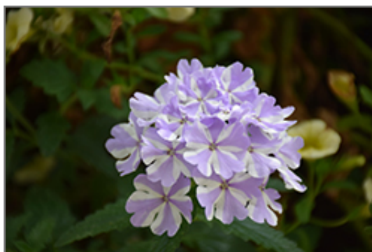
Superbena Stormburst Verbena flowers

Superbena Stormburst Verbena is recommended for the following landscape applications;