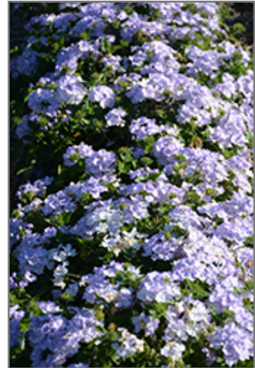
Superbena Stormburst Verbena in bloom

Superbena Stormburst Verbena will grow to be about 10 inches tall at maturity, with a spread of 24 inches. When grown in masses or used as a bedding plant, individual plants should be spaced approximately 12 inches apart. Its foliage tends to remain low and dense right to the ground. Although it's not a true annual, this fast-growing plant can be expected to behave as an annual in our climate if left outdoors over the winter, usually needing replacement the following year. As such, gardeners should take into consideration that it will perform differently than it would in its native habitat.