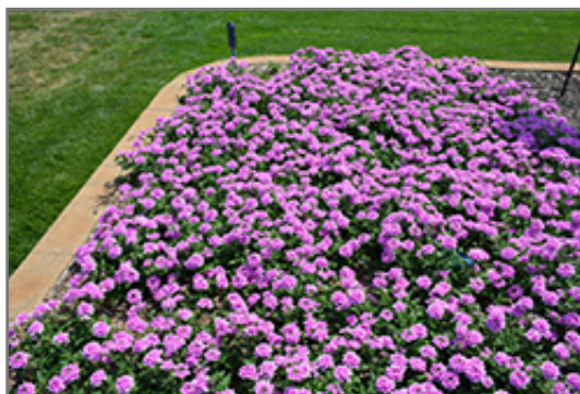
EnduraScape Pink Bicolor Verbena in bloom