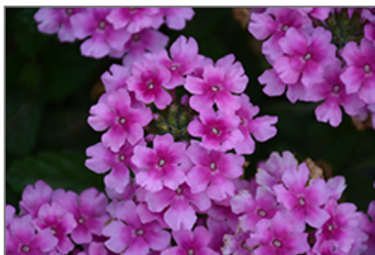
EnduraScape Pink Bicolor Verbena flowers

EnduraScape Pink Bicolor Verbena is recommended for the following landscape applications;