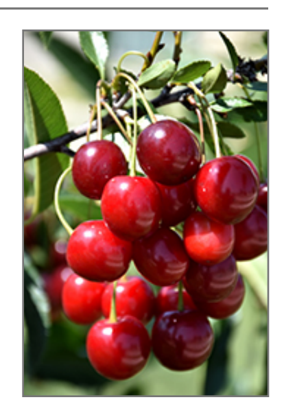
Sweet Cherry Pie Cherry fruit

Aside from its primary use as an edible, Sweet Cherry Pie Cherry is sutiable for the following landscape applications;