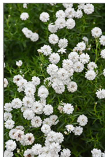
Peter Cottontail Yarrow flowers