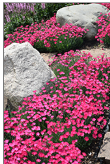
Paint The Town Magenta Pinks in bloom

Paint The Town Magenta Pinks is recommended for the following landscape applications;