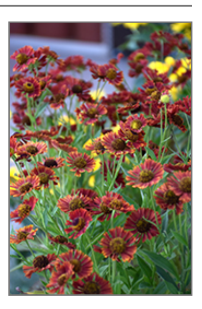
Mariachi Siesta Sneezeweed flowers

Mariachi Siesta Sneezeweed is recommended for the following landscape applications;