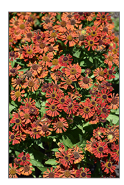
Mariachi Siesta Sneezeweed flowers