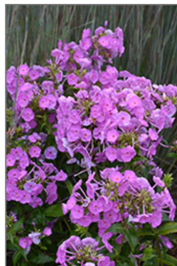
Fashionably Early Flamingo Garden Phlox flowers

Fashionably Early Flamingo Garden Phlox is recommended for the following landscape applications;